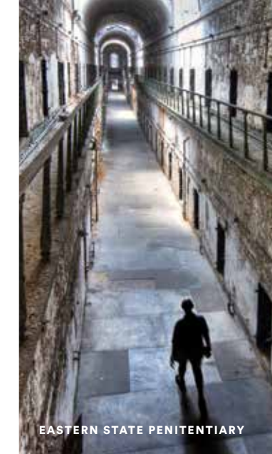
EASTERN STATE PENITENTIARY