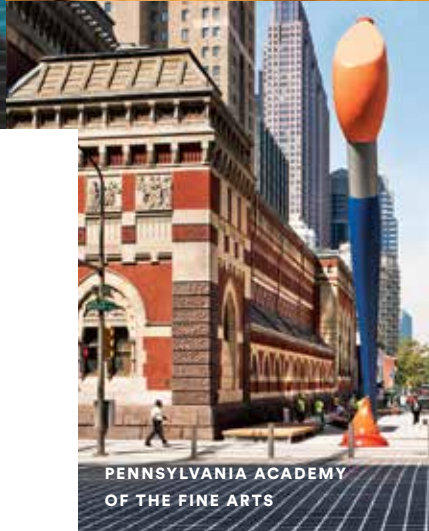
PENNSYLVANIA ACADEMY OF THE FINE ARTS

Philadelphia revels in the American tradition, though we're anything but traditional. You'll have to go off the beaten cobblestone to see what makes us so unique.