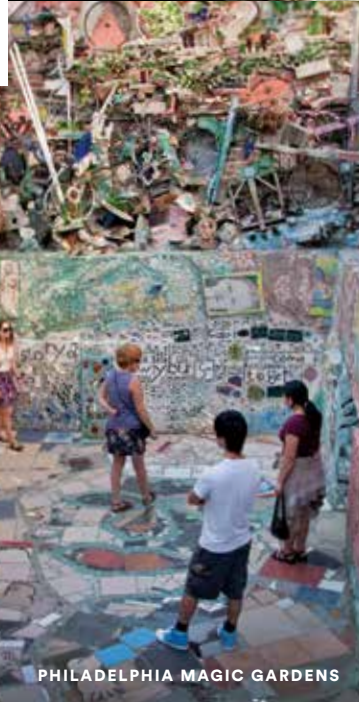
PHILADELPHIA MAGIC GARDENS