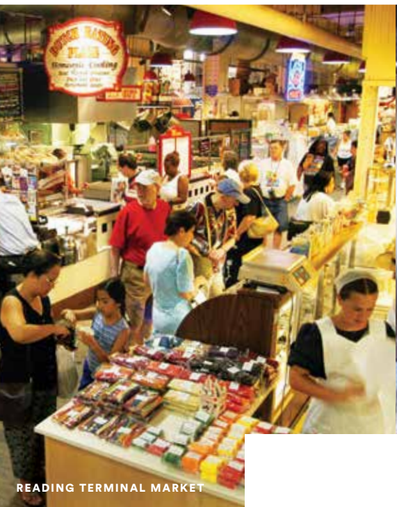
READING TERMINAL MARKET