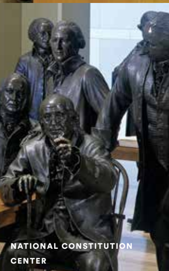
NATIONAL CONSTITUTION CENTER